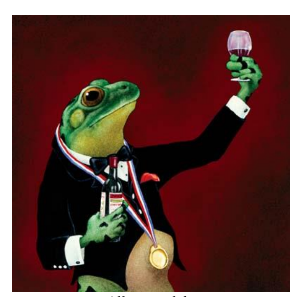
All artwork by Will Bullas