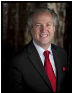
Manfred Honeck Music Director

Renowned for his distinctive interpretations, Manfred Honeck has served as music director of the Pittsburgh Symphony Orchestra since the 2008-2009 season. He and the orchestra are consistently recognized for their performances and are celebrated both in Pittsburgh and abroad. To great acclaim, they regularly perform in major music capitals and festivals, among them the BBC Proms, Musikfest Berlin, Lucerne Festival, Rheingau Musik Festival, Beethovenfest Bonn, Grafenegg Festival, Carnegie Hall, and Lincoln Center. Honeck and the Pittsburgh Symphony also have built a close relationship with the Musikverein in Vienna. Following a week-long residency in